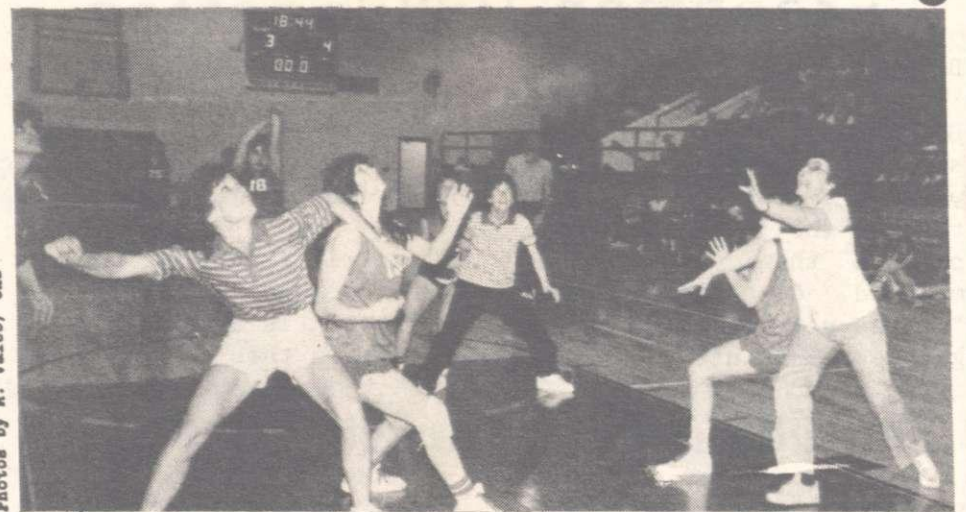
The faculty vs. 8th grade girls vie for the ball.

$3 $3.00 OFF $3 1984-85 ANNUAL pay $12 1985-86 ANNUAL pay $17 Supply is Limited First Come First Serve See Mr. Valco (room 118) $3 $3